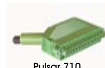
Pulsar 710 Connector

*** Product configuration identifier assigned by Ai at the time the order is placed.